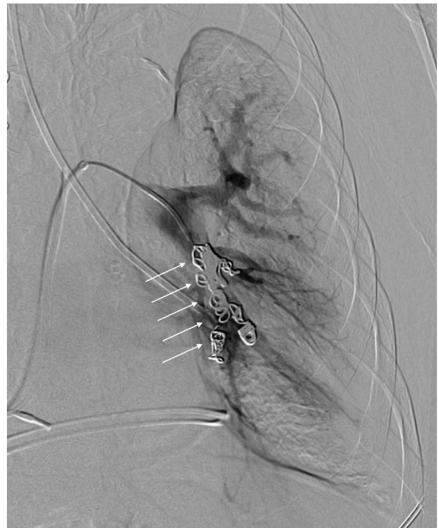
FIGURE 3. Fluoroscopic image showing coil embolization of the main and 3 basilar branches of the left lower lobe pulmonary artery. White arrows show coils.

VA-ECMO, bronchial blockers with or without fibrin glue, and reversal of anticoagulation is often successful in temporizing the bleeding. 5 Selective PA coil embolization for persistent bleeding has not been reported to our knowledge. In our case, it was considered the only viable treatment option, given the distal nature of the PA injury, calcified or fragile vascular tissue, the presence of reperfusion lung injury, and the overall medical stability of the