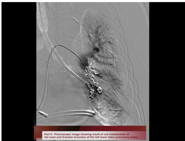
VIDEO 1. Part I: Fluoroscopic video showing result of left lower lobar medial basilar branch coil embolization. Part II: Fluoroscopic image showing result of coil embolization of the main and 3 basilar branches of the left lower lobar pulmonary artery. Video available at: https://www.jtcvs.org/article/S2666-2507(20)30429-6/fulltext .