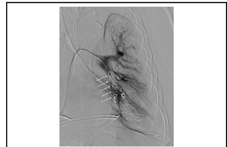
Left lower lobe main trunk and basilar branches coil embolization.

https://doi.org/10.1016/j.jtc.2020.08.050