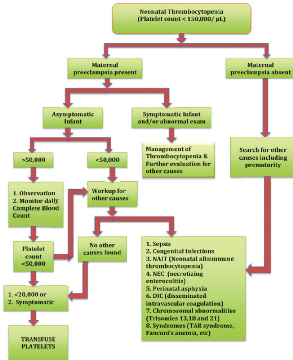
Fig. 2 Diagnostic approach of neonatal thrombocytopenia secondary to preeclampsia (preE) and other causes. There can be four groups of infants based on whether the infant is symptomatic or not and platelet count is above or below 50,000/ \mu\text{L} . It can also be early- or late-onset type of thrombocytopenia depending on the time of onset before or after 72 hours of life. No further intervention if platelets are > 50,000/\mu\text{L} and the infant is asymptomatic. Further evaluation is needed to find out other causes in case if it is not due to preE. (Adapted from Chakravorty and Roberts. 15 )

important and devastating bleeding event is intraventricular hemorrhage (IVH). In addition, other less frequent bleeding events include pulmonary and gastrointestinal hemorrhage and some minor events such as petechiae, oozing at the puncture site, and bloodstained endotracheal secretions.