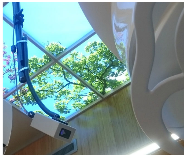
Fig. 1. Laser measurer mounted on the ceiling in the treatment room.

The aim of this study was to evaluate DIBH stability and reproducibility during left breast radiation treatments under the control of an in-house developed laser-based DIBH system for breast cancer patients. A secondary aim was to report doses to target and organs at risk (OAR).