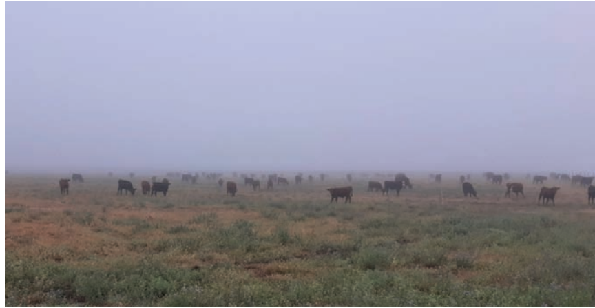
Figure 1. Beef cattle grazing in the province of Buenos Aires (Argentina).

the informal economy. Besides, urban employees with higher education receive higher payment than men or women with secondary instruction (García De Fanelli, 2016). Unfortunately, there are no available studies comparing different professions or types of degrees.