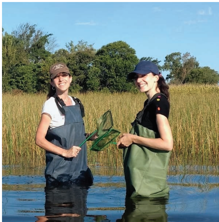
Figure 3. Photo of students at the School of Agriculture (University of Buenos Aires).

a presence countrywide through 15 regional centers, 52 experimental stations, more than 350 extension units, and research centers (6) and institutes (22). It employs nearly 7,000 staff, of which 2,000 are R&D professionals, 2,000 are extension specialists, 2,400 are technical and support personnel, and 600 are scholarship researchers. Approximately, 700 are staff doing research in animal science disciplines (C. Roig, personal communication). CONICET is the main science and technology