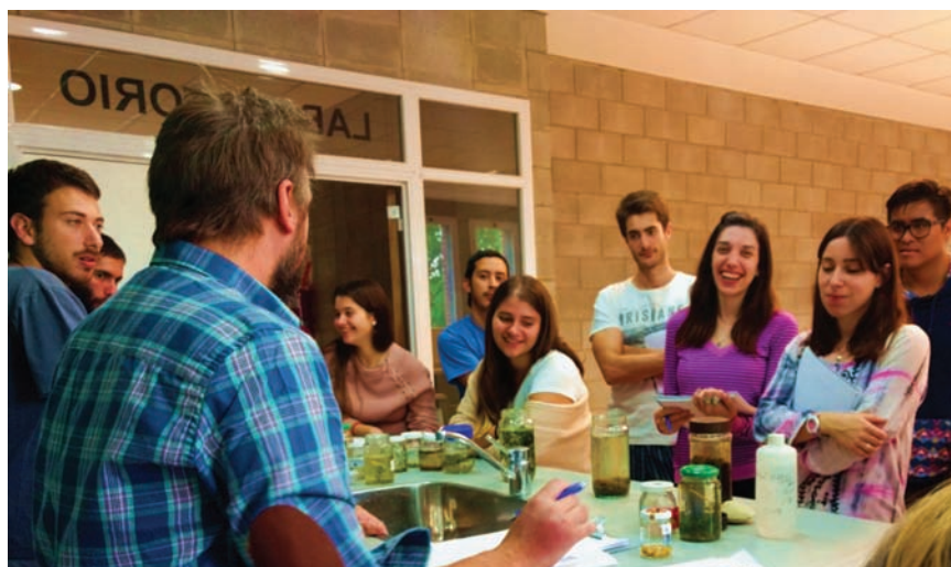
Figure 5. Students attending a class in the School of Agriculture (University of Buenos Aires).

In Argentina, demands on animal production systems and agriculture, in general, resemble what has been happening