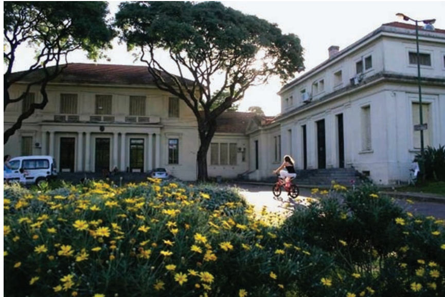
Figure 2. School of Agriculture—University of Buenos Aires.

Council). In addition to the above-mentioned institutions, provincial institutes of scientific and technology development exist.