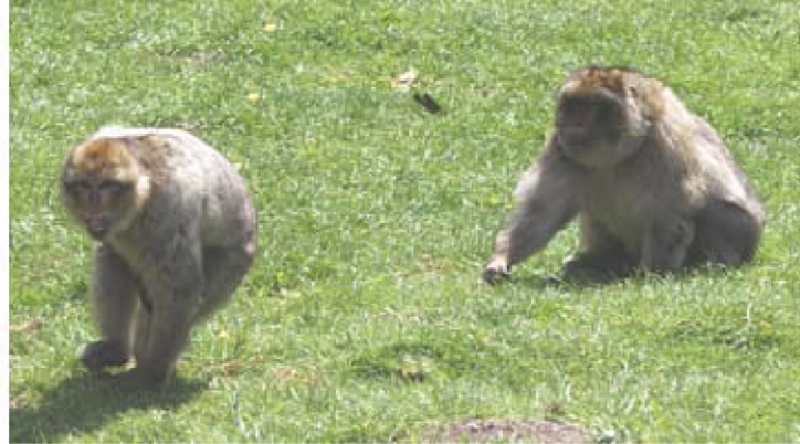
Figure 1. Example of Barbary macaque social interaction scenes. doi:10.1371/journal.pone.0056437.g001

The number of fixations and viewing time directed at each local region were normalized as a proportion of the total number of fixations and viewing time sampled in that trial. As the same type of local region varied in size across intra- and inter-species images (e.g. two individuals in the same image could vary in body size), the proportion of the image area constituting each local region was subtracted from the proportion of viewing time directed at that region in a given trial. This measure gave us ‘normalized’ viewing time as a percentage for each image region, with positive or negative values indicating more or less viewing time than predicted by a uniform looking strategy [13,14].