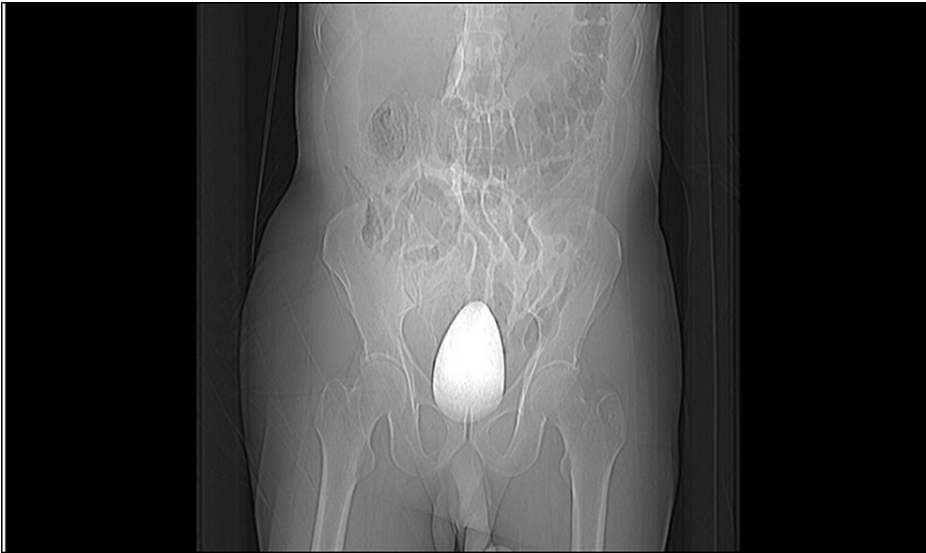
FIGURE 1: Abdominal x-ray showing the presence of a large foreign body in rectum.