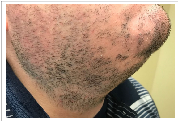
Figure 1. Patches of alopecia areata of the beard of patient 1 before treatment.

AA: alopecia areata; MS: multiple sclerosis; RRMS: relapsing–remitting multiple sclerosis; ILK: intralesional Kenalog (triamcinolone acetate) injections (concentrations ranged from 3 to 8 mg/mL); BMV: betamethasone valerate topical solution (0.1%, applied daily); Minoxidil (5% foam, applied nightly); PPMS: primary progressive MS.