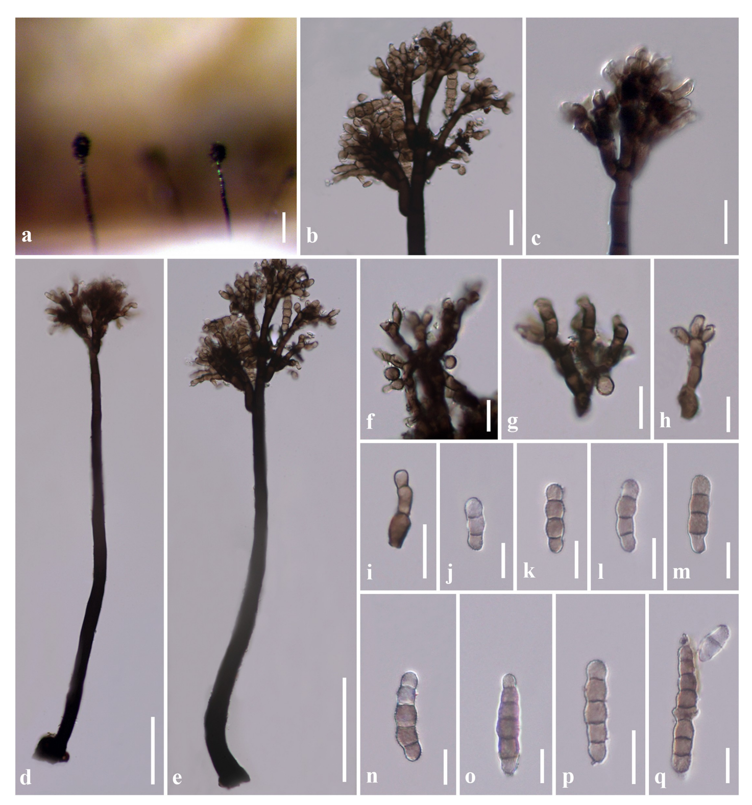
Fig 2. Dendryphion hydei (HKAS 97479, holotype) a Colonies on branch of Bidens pilosa . b, c Apex of conidiophores with conidial structures. d, e Conidiophores. f–i Conidiogenous cells. j–q Conidia. Scale bars: a = 100 \mu m , d, e = 50 \mu m , b, f–i = 20 \mu m , b, c, f–q = 10 \mu m .

https://doi.org/10.1371/journal.pone.0228067.g002