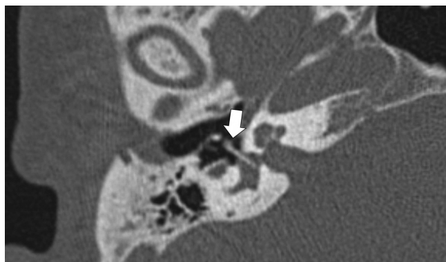
Figure 2. Preoperative noncontrast axial computed tomography of temporal bones. A 7.0-mm, right-sided calvarial bone strut total ossicular replacement prosthesis (arrow) sitting adjacent to the umbo with a medial segment extending through the oval window, deep into the vestibule.

unchanged bone conduction and improved discrimination scores.