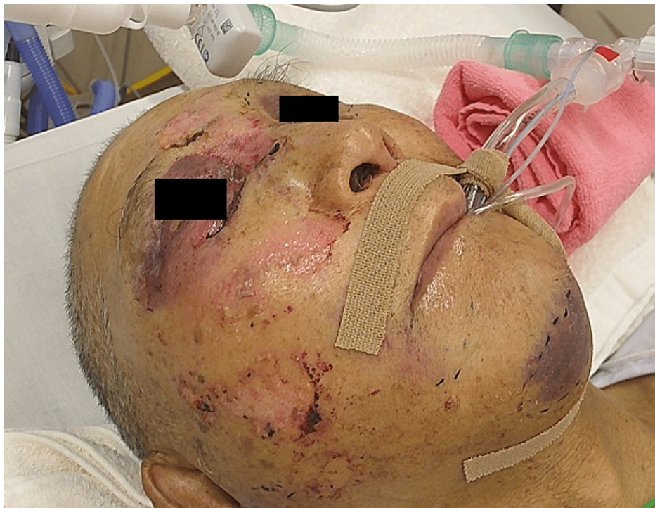
FIGURE 1: Facial appearance after intubation on admission day

Prominent swelling from the right cheek to the mandible due to bilateral mandibular fractures is observed