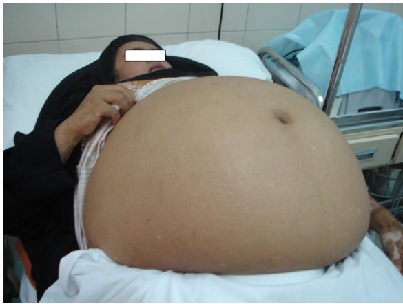
Figure 1 A giant pelvi-abdominal mass noticed on abdominal examination.

xiphisternum, to deliver the cystic mass intact without exposed it to the risk of rupture intraperitoneally. The outer surface of the mass was smooth and intact all-around without external growths or adhesions. The uterus, right adnexa, and appendix were looking healthy. No ascites or enlarged para-aortic lymph nodes were discovered. Left salpingo-oophorectomy was performed as the whole ovary was involved in the mass and the left tube was abnormally dilated and adherent to the mass (Figure 3). The size of the tumour was 42 \times 28 \times 25 cm with 7,250 kg in weight. Microscopic examination revealed a cyst lined by a single layer of non-ciliated columnar epithelium without stromal invasion, the picture of which is compatible with mucinous cystadenoma (Figure 4). Postoperative recovery was uneventful and the patient was discharged on the 5 th postoperative day to be followed-up every 3 months.