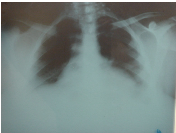
Figure 2 Plain chest X-ray shows no pleural effusion or metastasis. Upward displacement of the diaphragm affecting air entry into the lower lobes of lungs (explains patient's tachypnea).