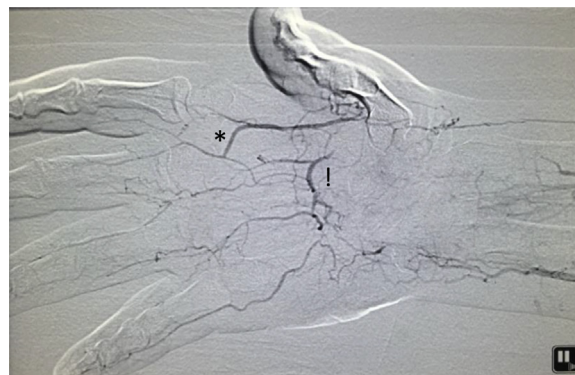
Fig 2. Right upper extremity arteriogram demonstrating patency of two small areas of the superficial (*) and palmar (!) arches with absence of blood supply to the thumb and diminished blood supply to the second to fifth digits.

Given the microvasculature involvement, this patient's disease was not amenable to surgery. We provided medical management to prevent further damage, including topical nitroglycerin and a calcium channel blocker. We also recommended cessation of smoking and use of vibrating tools. Because he was the owner of the business, the patient agreed to abstain from all tool use and to delegate responsibility. At his 1-month follow-up, the patient reported that he was compliant with his treatment strategy, including abstaining from tool use; his wounds had decreased to small scabs, and