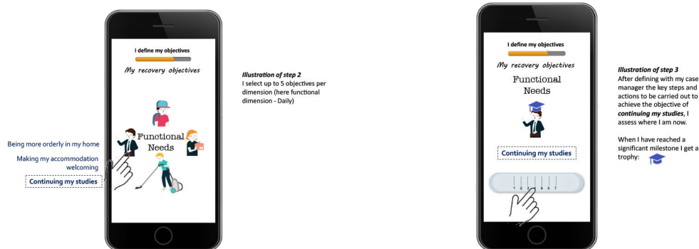
Figure 2 Example of a possible prototype for PLAN-e-PSY.

out to achieve his or her objectives. Each action could require the intervention of a facilitator and/or the use of a psychoeducational information sheet or an online resource that can help the user in their recovery process. The whole process of defining objectives should not exceed 15 days.