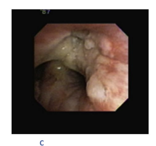
Fig. 1. Bronchoscopy shows mucous-like layer in the bronchotrachial tree. A) Right upper lobe apico-posterior B) Bronchus intermedius C) Secondary carina right side.

Patient was initiated on Voriconazole. Repeat bone marrow biopsy was negative for Aspergillus. The patient was discharged on Voriconazole and oxygen. Despite treatment the patient died of progressive pulmonary infiltrates and respiratory failure.