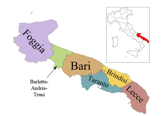
Figure 1 Apulia, South-Eastern Italy, 4 million inhabitants.

cost of a new drug, it is often impossible to appreciate the whole possible positive impact following the introduction of a new treatment; that is the case of direct anticoagulants in the prevention of thromboembolic complications of atrial fibrillation.<sup>16</sup> When, instead, also individual, municipality and social costs are duly weighted, apparent increased costs may turn into considerable savings.