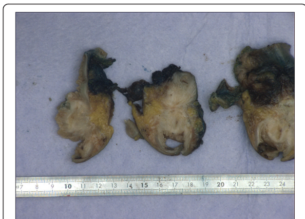
Figure 3 Extensive fibrotic foci can be seen with induration in the intestinal wall without mucosal abnormalities.

rectosigmoid [2,3,10,11]. Additional common locations for ingrowths are the uterosacral ligaments, vagina, bladder and ureters [10].