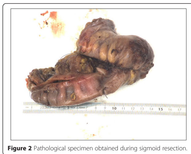
Figure 2 Pathological specimen obtained during sigmoid resection.

A macroscopic pathological examination of the resected sigmoid showed extensive fibrotic foci with induration in the intestinal wall without mucosal abnormalities (Figures 2 and 3). In the sigmoid wall, a tumor 4.4cm in size was found; however, this did not appear to have an obvious relationship to the mucosa. Microscopically, the tumor showed epithelial tubular structures surrounded by what was interpreted as cytogenic stroma and focal hemorrhage remnants, suggestive of endometriosis (Figure 4). Foci of tubes with ciliated columnar epithelium were present in some lymph nodes.