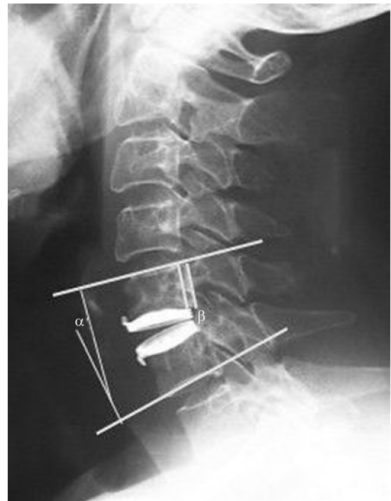
Figure 2 The T1 slope ( \alpha ) was measured as the angle between a horizontal line and cephalad endplate of T1 in standing lateral radiographs. SACS ( \beta ) was defined as the angle formed by the caudal endplates of C2 and C7 in standing lateral radiographs. Abbreviation: SACS, sagittal alignment of the cervical spine.

Statistical analyses were performed using SPSS software (SPSS Inc., version 22.0; Chicago, IL, USA). The significance of differences between measurements taken at baseline and at final follow-up was analyzed using the paired sample t -test. The independent t -test or chi-square test were used to identify significant differences between groups. Multivariate