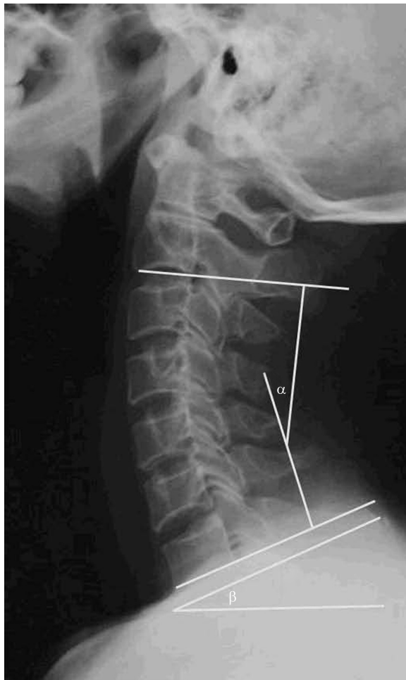
Figure 1 The FSU angle ( \alpha ) was examined on lateral radiographs and was formed by lines drawn at the superior endplate of the cephalad vertebral body and at the inferior endplate of the caudal body. The distance ( \beta ) between the vertebral endplate and implant shell on the lateral view was measured.

Abbreviation: FSU, functional spinal unit.