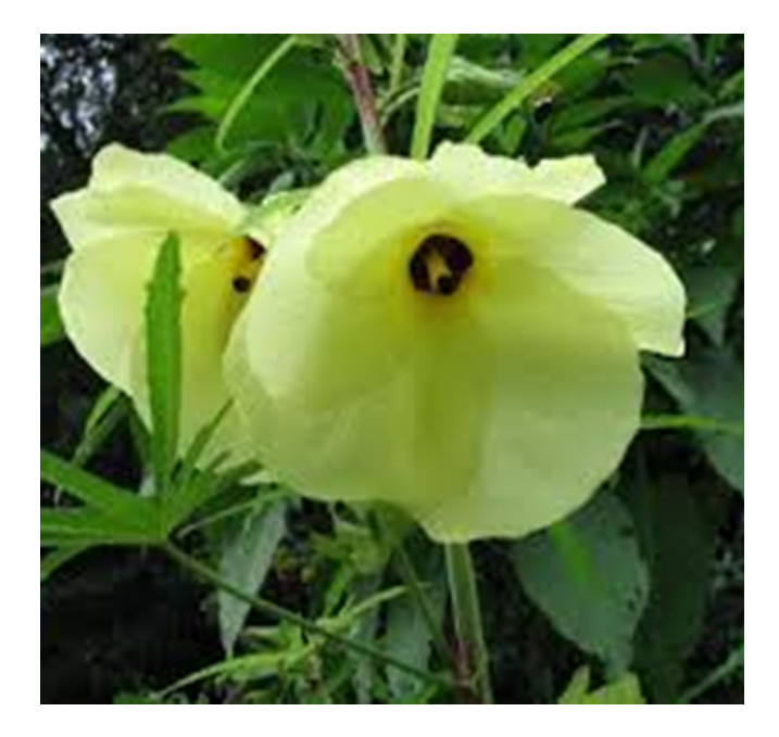
FIGURE 1 A flower of Abelmoschus manihot [Colour figure can be viewed at wileyonlinelibrary.com]