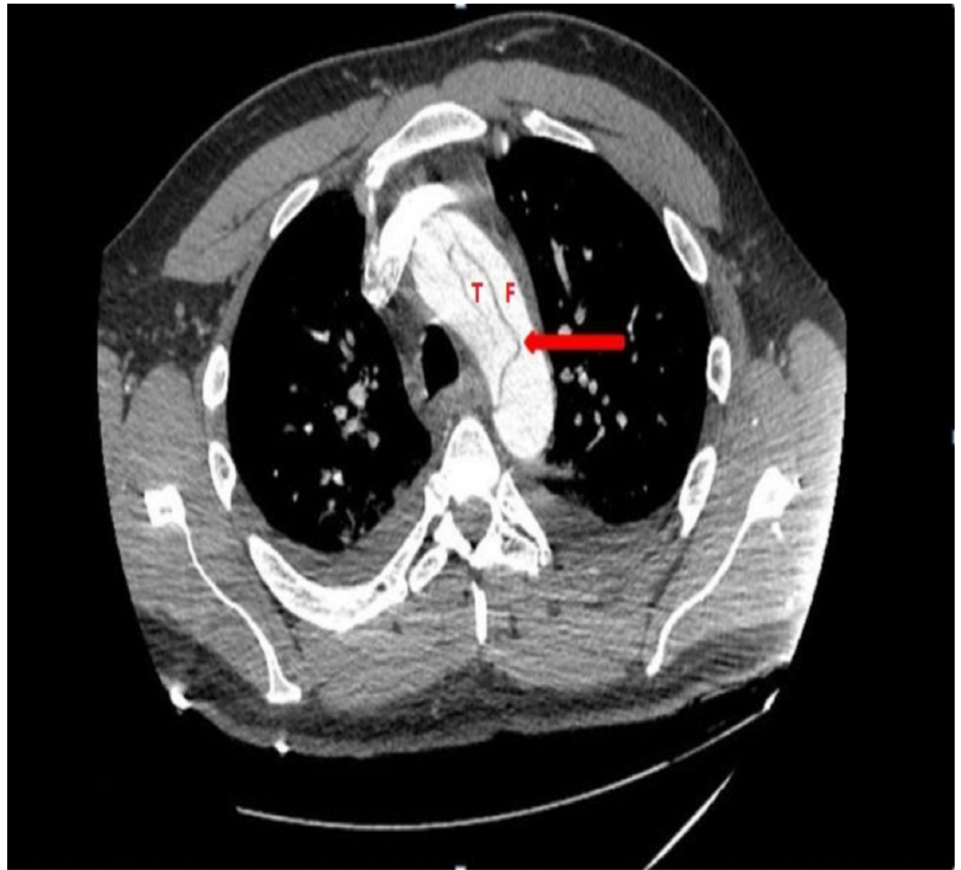
FIGURE 2: Computed tomography showing aortic dissection with arrows pointing towards the intimal tear in the aortic arch separating the true lumen (T) from the false lumen (F).