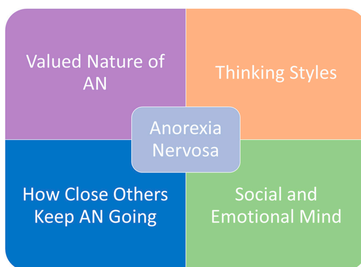
Figure 1. The cognitive–interpersonal maintenance model of anorexia nervosa.

values certain aspects of the illness and does not identify themselves as ‘sick’. In the next iteration of the model, we outlined the underpinning neuroscience, the interaction between vulnerability traits and eating disorder behaviours, and how this serves to strengthen the hold of the disorder, allowing it over time to develop a life of its own [3]. Indeed, individuals with a persistent form of the illness often state that they want to change but cannot do so. Examples of interactions between vulnerability traits and eating disorder behaviours include personality traits such as conscientiousness and introversion [4], which can predispose to disordered eating [5] and allow eating disorder habits to become fixed. Furthermore, recent genetic findings reported on correlations between polygenic risk scores, not only with other “brain” disorders, but also with “metabolic” traits related to growth, size, lipids, and insulin sensitivity [6]. Thus, a possible hypothesis is that homeostatic forces maintaining energy balance might be weaker in terms of increasing appetite and stronger in terms of a foraging or over active response to “food shortage”. This argument has been developed in more detail in an evolutionary-based model of AN and might benefit from further exploration [7].