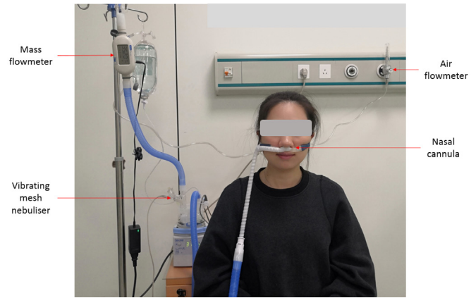
Figure 2 Device set up.

A calibrated back pressure compensated air flowmeter will be attached via T-piece adapter with VMN at the inlet (dry side) of a heated humidifier (MR 850, Fisher & Paykel, Auckland, New Zealand). A single limb heated wire circuit will be attached to an adult HFNC (Optiflow, Fisher & Paykel, Auckland, New Zealand), with prong size