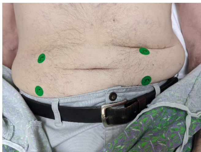
Fig. 2. The green dots (Numbered 1-4) represent the quadrants for auscultating bowel sounds. (Color version of figure is available online.)

During the head-to-toe and medication administration scenario, paired students worked with SPs to assist them with correct stethoscope placement. Each student was given 25 minutes to complete a head-to-toe assessment and administer one medication to the SP. The students used the dots to assess the radial and apical pulse rates, then determined if medication administration was safe. The scenario included two medications, and students were expected to use critical thinking and assessment findings to administer medications safely. Similar to Weaver and Jones (2020), while one student was performing the head-to-toe assessment on the standardized patient, the partner used head-to-toe and medication administration grading rubrics to give feedback at the end of 25 minutes. Faculty observed students and were available to (a) provide corrective and immediate feedback, (b) answer students' questions during the experience, (c) clarify safety issues during the debriefing, and (d) correct student misconceptions.