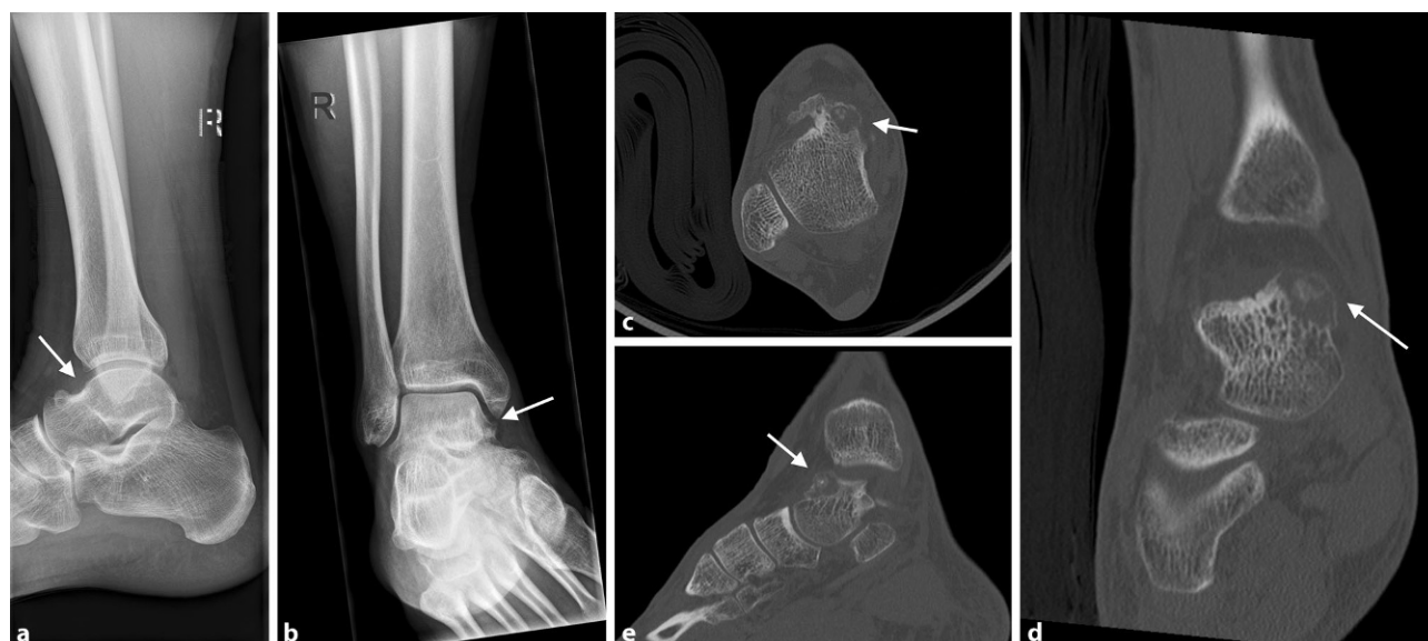
Fig. 2 a, b 18-year-old male patient with osteoid osteoma located in the talar neck of the right foot adjacent to the medial talar shoulder, presenting as blurred, lucent region on the anteroposterior (ap) ( a ) and lateral ( b ) view (arrows pointing at the

Treatment and outcome variables pain relief (with preoperative and postoperative visual analogue scale (VAS) scores, where available), local recurrence, postoperative mobility and complications where likewise