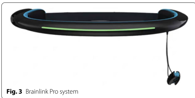
Fig. 3 Brainlink Pro system