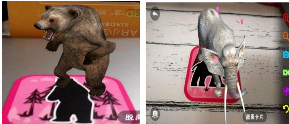
Fig. 1 AR materials

animals on the front and corresponding animal pictures on the back. In this study, 12 animal cards were selected. The words in these cards come from the 12 animal words in the textbook for third graders this semester (Hebei Education Press). Students scan animal pictures through mobile phones for AR learning. After scanning, students can see three-dimensional animal images (visual), accompanied by animal calls (auditory), Chinese, English, Russian and Korean pronunciation and animal habits. At the same time, students can create interactions by interacting with the screen. On this basis, students can choose what they need to learn and become the subject of learning to a certain extent.