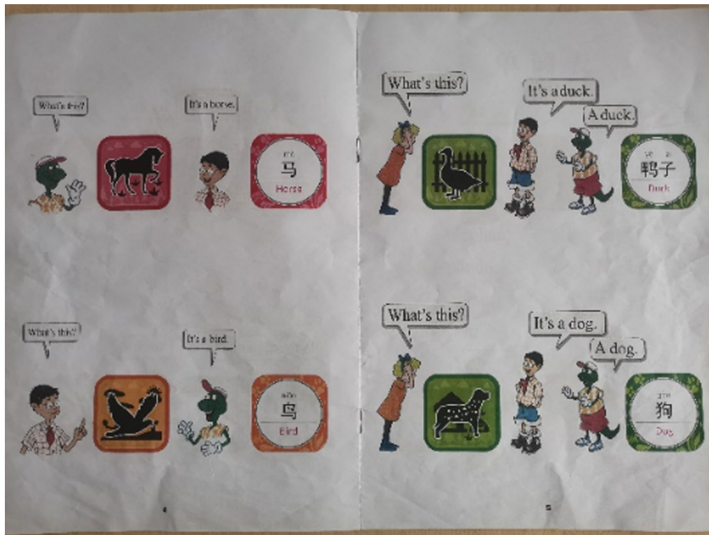
Fig. 2 Text material