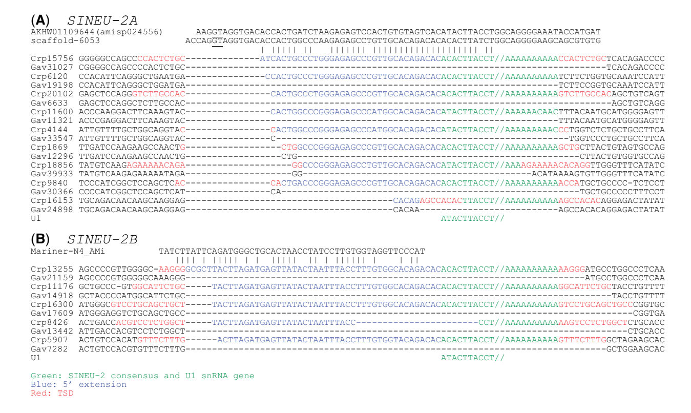
Fig. 2.—Crocodile lineage-specific insertions of SINEU-2 with 5' extensions. Crp represents the crocodile scaffold sequence and Gav represents the gharial scaffold sequence. SINEU-2 sequences are colored in green with their 5' extension in blue, and putative TSD sequences characterized based on the corresponding "empty" sites in gharial are in red. (A) SINEU-2A with 5' extension. Intron sequence for AKHW01109664, which encodes a protein annotated as amisp024556, from alligator is shown. Scaffold-6053 is a crocodile sequence that has the sequence similar to the 5' extension sequences of SINEU-2A. (B) SINEU-2B with 5' extension. The 5' extension sequences show similarity to the consensus of Mariner-N4_AMi.

and TST) were observed aside from the cases where no nucleotide was altered upon integration.