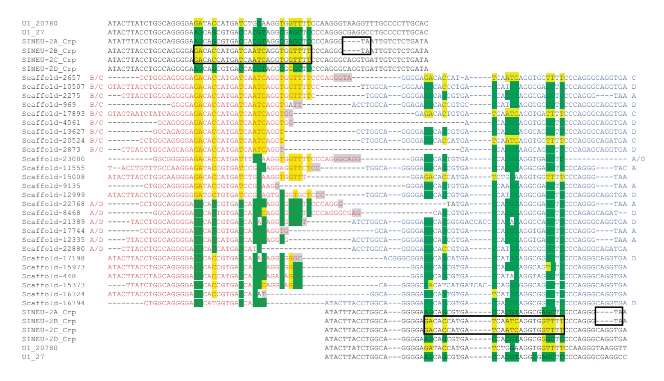
Fig. 4.—Alignment of SINEU-2_Crp copies with the 5' extension sequences similar to U1 snRNA genes. The consensus sequences of SINEU-2_Crp subfamilies and also two representative U1 snRNA gene sequences (in scaffold-20780 and scaffold-27) are shown. The regions distinguishing different SINEU-2_Crp subfamilies are boxed. The 5' extension sequences are colored in red and the downstream SINEU-2_Crp sequences are in blue. Nucleotides different among SINEU-2_Crp subfamilies are highlighted by either green or yellow. Nucleotides that can be aligned as either the 5' extension sequences or the downstream SINEU-2_Crp sequences are shaded. If the sequence corresponds to a specific SINEU-2_Crp subfamily or subfamilies, it is indicated

clearly show that SINEU-2 heads were generated through multiple events of 5' sequence addition onto SINEU-2 copies, not by the retrotransposition of a single master copy.