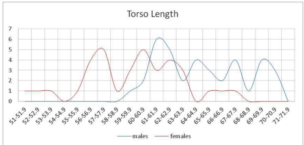
FIGURE 2: Distribution of the torso length (cm) in both sexes

The mean torso length was 62.27 cm (SD=±4.325, SE=0.496), with a minimum of 51.5 cm and a maximum of 70.0 cm (Table 1). A statistically significant difference was found between the two sexes (p<0.001). The torso length distribution (cm) is shown in Figure 2.