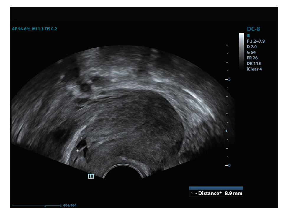
Figure 2. The depth of the isthmocele measurement.

The height, depth and width of the isthmocele were measured, and the volume was calculated (Figs. 1, 2). Residual myometrial thickness was also measured on the same day. Ultrasonographic images were taken of each patient. The embryos were frozen at 3 days after the intracytoplasmic sperm injection procedure. The depot GnRH agonist leuprolide acetate (3.75 mg;