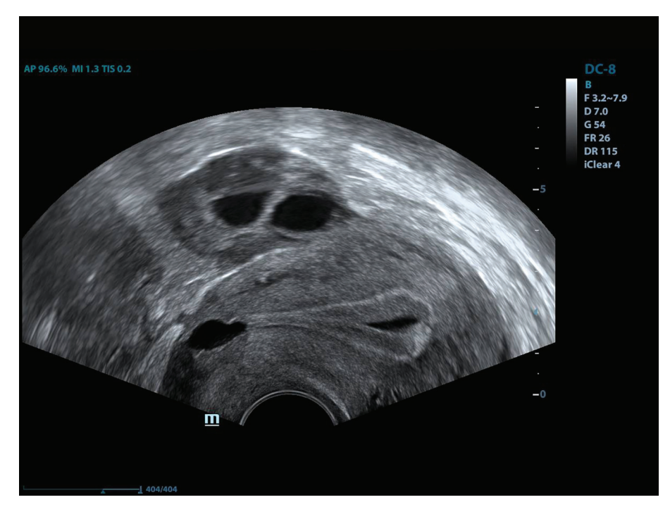
Figure 4. The view of the intrauterine fluid.

important phenomenon is the brown bloody discharge observed on the tip of the embryo transfer catheter after embryo transfer in most isthmocele patients. The origin of this discharge is the liquid inside the uterine cavity (Fig. 4). We noted no such discharge in any case treated with NIIT in this study. Also, there was neither postmenstrual spotting nor blood accumulation in the isthmocele in our patients after treatment. Frozen-thawed embryo transfer may be a better option than fresh embryo transfer in isthmocele cases. Estrogen levels in frozen embryo transfer cycles are lower than those in fresh cycles, which in turn lead to lower levels of secretion and fluid accumulation in the uterine cavity.