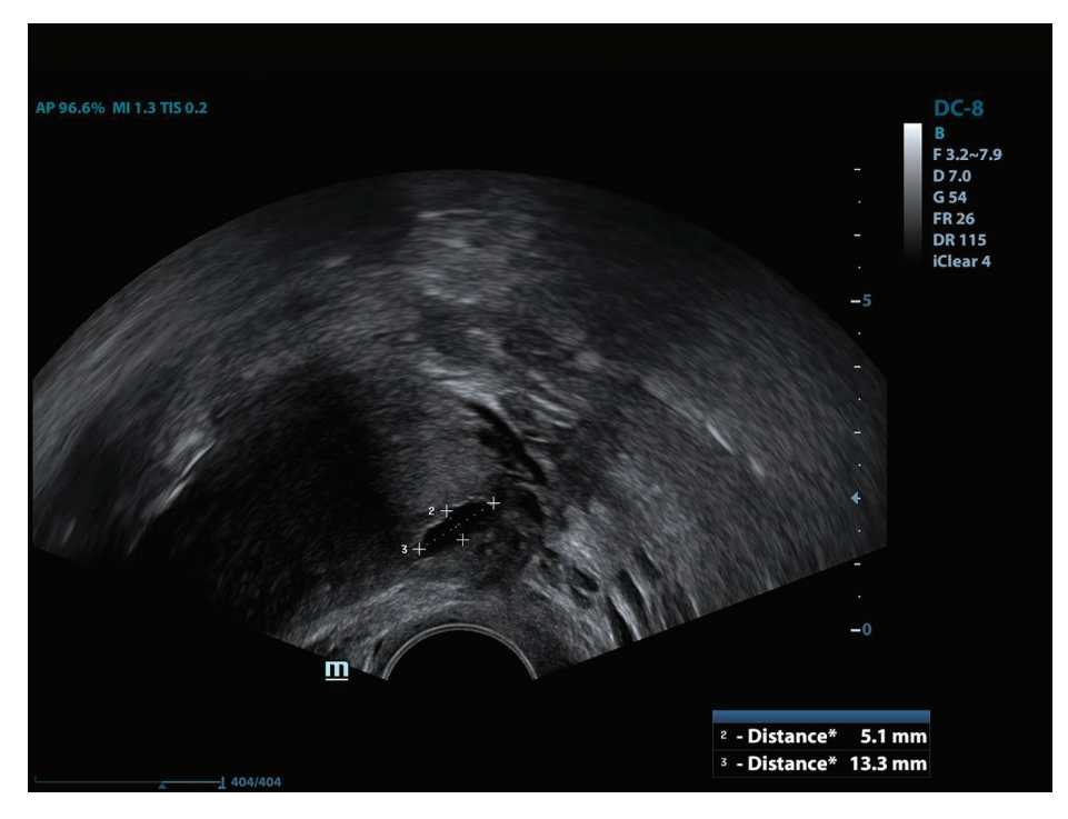
Figure 1. The height and width of the isthmocele measurement.

(Cetrotide, 0.25 mg; Merck, Kenilworth, NJ, USA) was started and human chorionic gonadotropin (hCG; Ovitrelle, 250 \mu g; Merck) was administered when there were at least two follicles > 18 mm in length. Transvaginal ultrasound-guided follicular aspiration was performed at 36 h after hCG injection. All women underwent transvaginal ultrasonography on the trigger day.