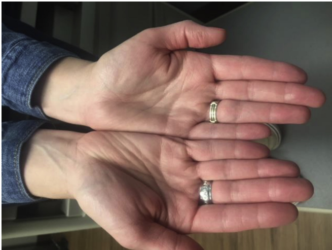
Fig 3. Dampened waveform for the left third digit compared with the right for patient 3.

blue-purple color changes on the left third finger. Physiologic testing demonstrated dampening of the arterial Doppler digital waveform (Fig 2). A cold immersion test was performed, which was negative for any changes. The patient was prescribed 75 mg clopidogrel (Plavix) and was followed up 3 weeks later. Her symptoms had resolved at that time (Fig 3).