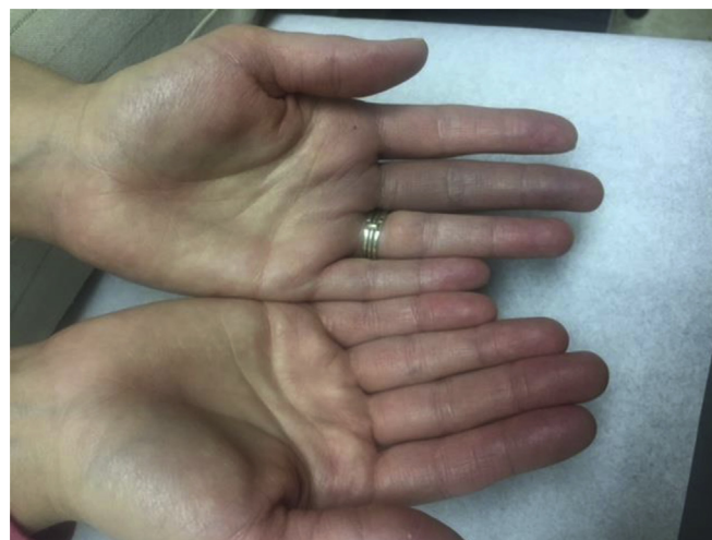
Fig 1. Physical examination findings at presentation for patient 3.

Patient 1. A nonsmoking 48-year-old woman with a medical history of hyperlipidemia had presented to an outpatient clinic with a 7-day history of complete volar discoloration of her left index finger. She stated she had awoken with blue-purple discoloration on the digit and had presented to urgent care where she was prescribed prednisone. She denied injury or exposure to cold temperatures at the time of onset. On resolution of the original symptoms, she had developed a small spot of discoloration on the left third finger associated with point tenderness. The patient had no neurologic symptoms associated with the discoloration. Physiologic testing with arterial Doppler waveforms demonstrated results within the normal limits for the bilateral upper extremities, with a dampened