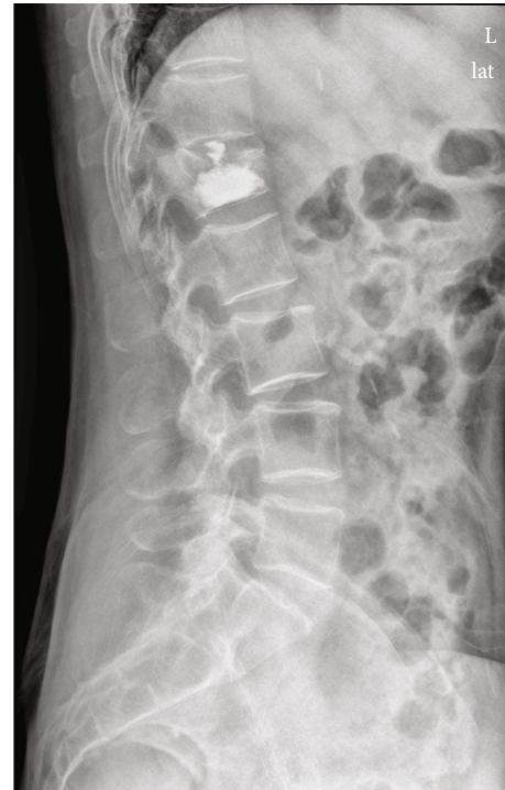
FIGURE 1: Cement leakage into the intervertebral disc on direct postoperative radiograph.

A 5 mL volume of cement was used as the cut-off, which was based on the report by Jin et al. [19], to compare the low- and high-volume groups. Patients were classified into the appropriate group for analysis: a low-volume group (group A) received a volume of cement \leq 5 mL, and a high-volume group (group B) received a volume of cement > 5 mL.