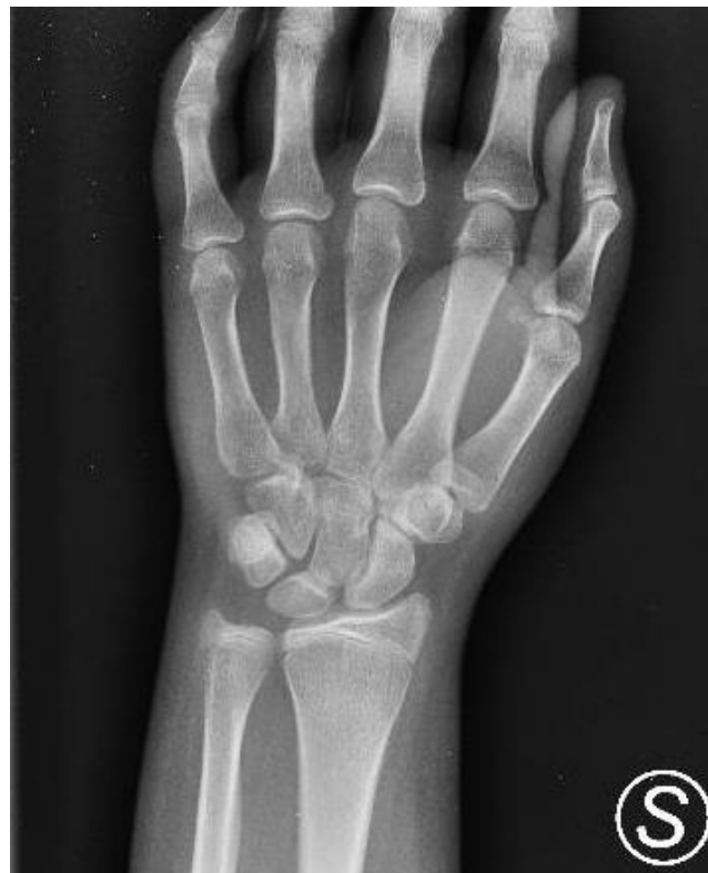
Figure 1. X-ray of the left wrist. Images not attributable to periosteal reaction.