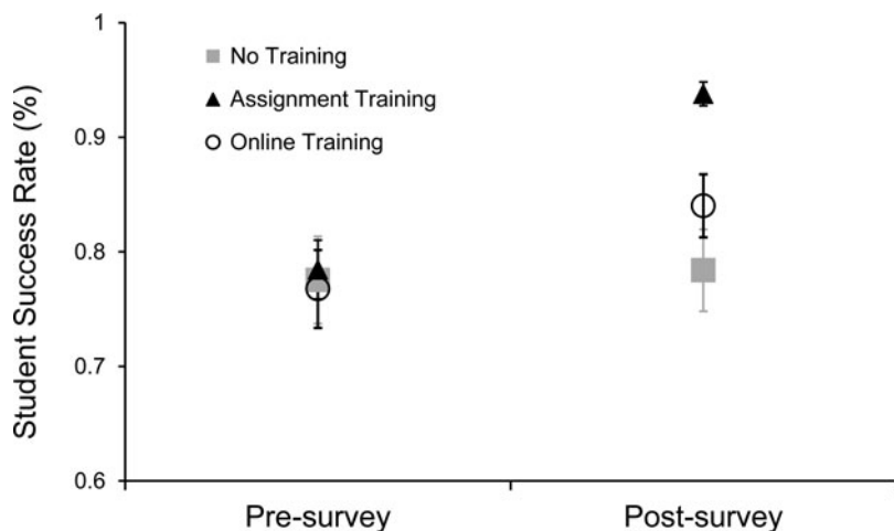
Figure 1. Comparison of student success rates (the proportion of responses correctly identified as plagiarized or not plagiarized) between the two survey periods. The homework assignment–training group (depicted by black triangles) exhibited a large significant learning gain over time relative to the no-training control (shown by gray squares). Additionally, the online-training group (depicted by open circles) showed a slight, yet significant, increase in postsurvey scores as compared with presurvey scores when compared with the no-training control. The data are inverse-link estimates of the means; error bars represent \pm 1 SE.

reported that their understanding of what constitutes plagiarism was good (54%), whereas almost a third indicated that their understanding was very good (32%), only 13% reported a fair understanding, and 1% reported a poor understanding of plagiarism.