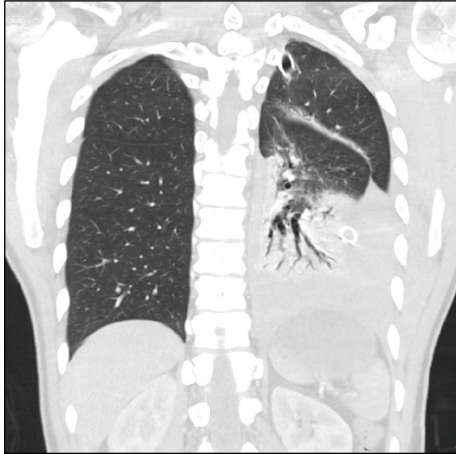
FIGURE 3: Computed tomography imaging of the chest revealing collapse of the left lower lobe and a large left-sided, high density pleural fluid collection suggestive of hemorrhage continuing into the thoracic cavity despite thoracostomy tube placement.

nearly all of these cases are clinically insignificant [2, 4]. Because of its rarity, there is inconsistency in the definition of what constitutes a “delayed hemothorax.” Some studies used hemothorax that developed after 24 hours with a normal initial CXR as a guideline to define a “delayed” hemothorax [2, 4, 9]. Others used development of hemothorax at any time after initial imaging showing no abnormalities, with or without a confirmatory second CXR [3, 5, 10]. A review of the relatively limited literature revealed that 85% of DHX cases were reported within seven days of the inciting incident, with approximately a quarter of all cases presenting in the first 96 hours [1, 4–13]. Critically, the existing retrospective reviews of DHX define the delay as the time to diagnosis with a follow-up CXR, meaning that the patient’s delayed bleed could have occurred at any time prior to that imaging. Since many of these patients are treated on an outpatient basis, this makes the actual time of the delayed bleed unclear. In this case, given his clinical presentation, it seems likely that the patient developed an acute large volume bleed a full ten days after the inciting event, in contrast to the usual slow accumulation of a small volume of blood in the vast majority of previously reported cases.