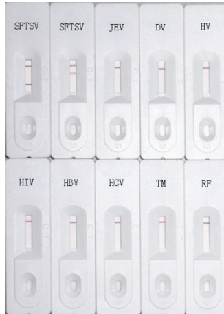
FIGURE 2: The specificity detection of the immunochromatographic strips for positive sera samples of IgM of SFTSV infection, IgG of SFTSV infection, Japanese encephalitis virus infection, Dengue virus infection, Hantavirus infection, HIV infection, HBV surface antigen, HCV antibody, Mycobacterium tuberculosis antibody, and RF, respectively.

were determined to be 98.4% and 100% for IgM and 96.7% and 98.6% for IgG, respectively. There was excellent agreement between the ICS results and the “gold standard” with Kappa_{IgM} = 0.989 and Kappa_{IgG} = 0.945 .