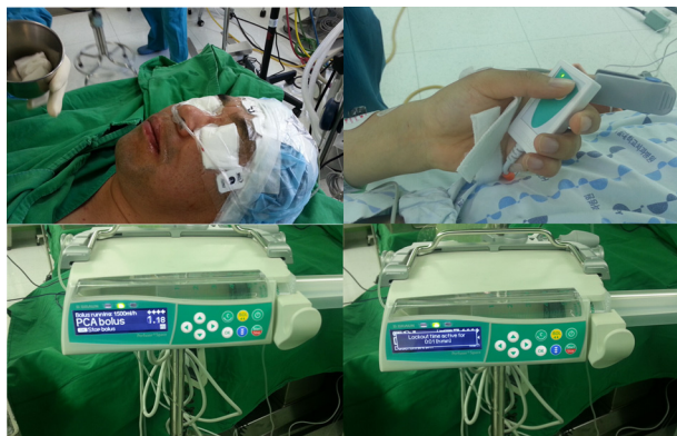
Fig. 1. Upper Left: Patient with nasal cannula and Bispectral index sensor, with 3 L/min O 2 supplied through the nasal cannula. Upper right: Demand button on patient's hand, with a Velcro belt that prevents the patient from missing the button; Lower left: Upon pressing the button, the patient is administered dexmedetomidine; Lower right: If the patient presses the button more than once within 1 min, the lock-out time is activated.

The patient maintained his state of consciousness and was able to respond to commands. His respiratory rate and vital signs also remained within a normal range (Fig. 2). During the operation, the button was pushed several times during painful procedures. Afterwards, the BIS value dropped to around 60 once, but was maintained around 90 throughout. The serum dexmedetomidine concentrations calculated from the patient and the number of times the button was pushed are shown in Fig. 3. The patient was discharged the next day without any complications.