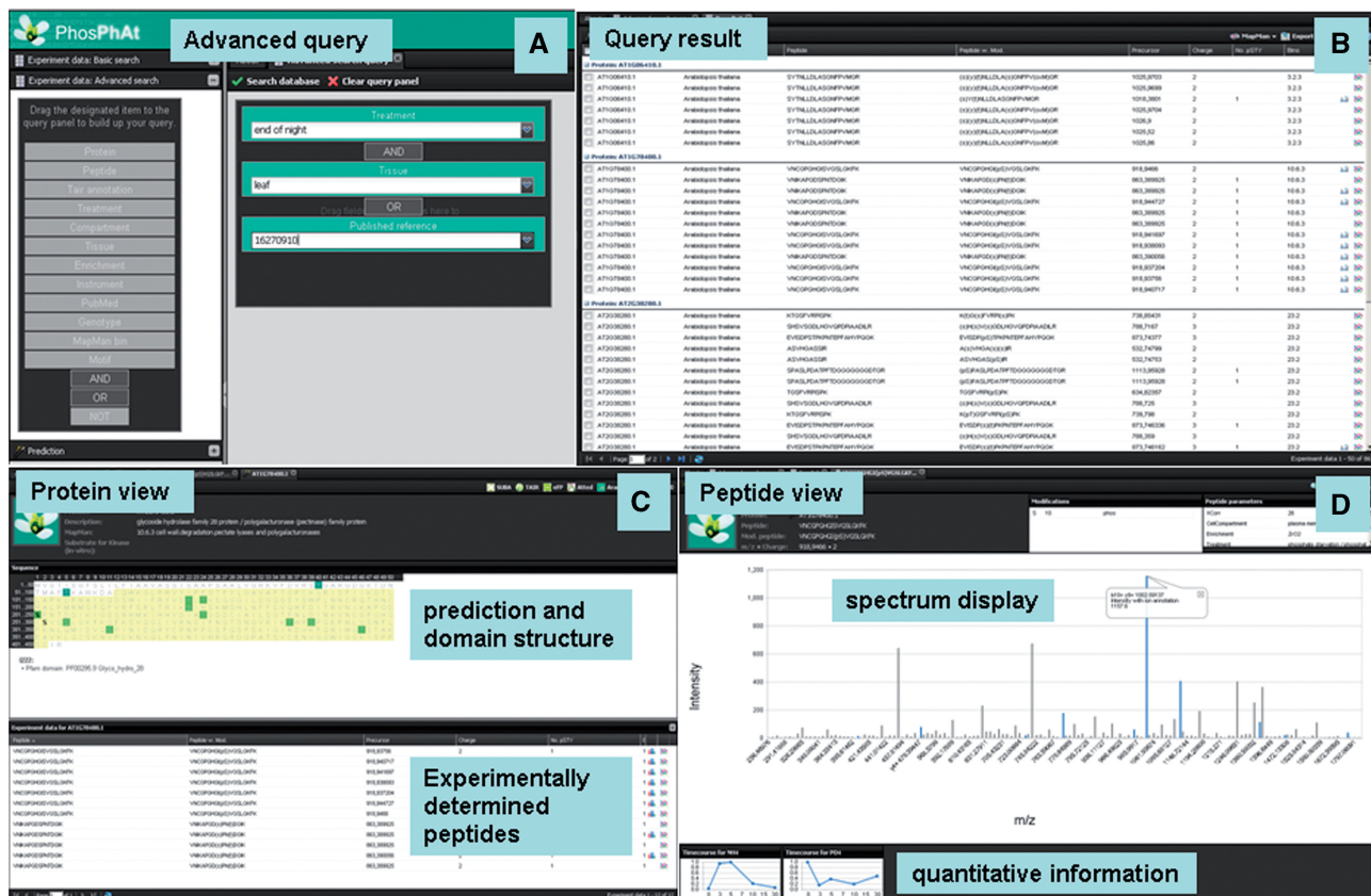
Figure 1. Screenshots of new PhosPhat web interface. (A) Entry screen with advanced search, (B) result window, (C) peptide summary and (D) protein summary.

At the level of the query result summary, the user has the choice of hand-selecting peptides or of selecting all unique peptide sequences present in the query result. The output format is as 13-mers centered on the phosphorylated residue. Only clearly assigned phosphorylation sites (i.e. those annotated as pS, pT and pY) will be included. For multiply phosphorylated peptides, each phosphorylation site will result in export of a separate 13-mer sequence. It is also now possible to export PhosPhat query results in a spreadsheet format. The spectra of individual phosphopeptides can also be exported as an image or in the mgf data format.