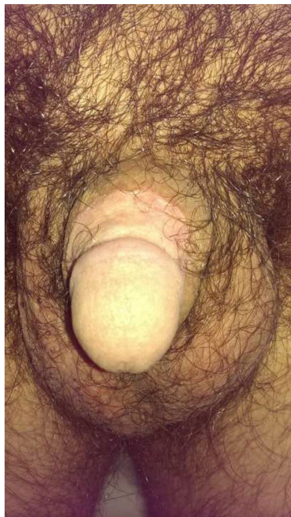
Fig. 3 Penis at 6-months postoperatively.