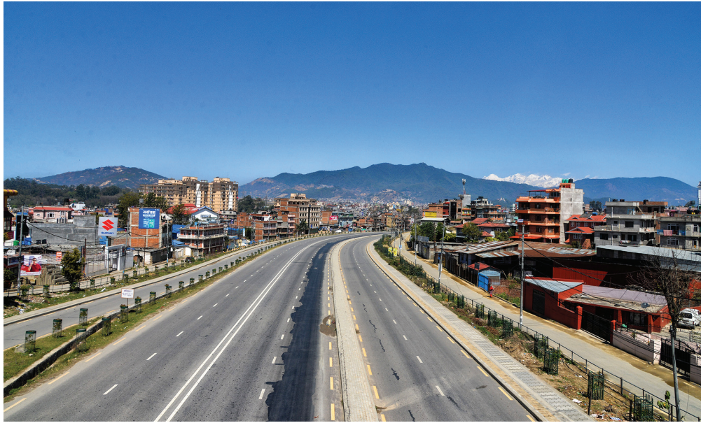
Photo: Empty streets of Kathmandu city due to nationwide complete lockdown, the capital of Nepal (used from the collection of Pramod Bhattacharya photo gallery with permission).

The government has limited capacity and expertise to chart any emergency measures to address these pertinent health issues, as the available resources are fully channeled towards combatting COVID-19. Prolonged exposure to malnutrition can weaken the immune system, especially during an epidemic outbreak. In Nepal, the coexistence of the double burden of malnutrition aggravates COVID-19 exposure and can perpetuate the vicious cycle of weakened immunity and infection [12]. Historically, Nepal has been facing food and nutrition security challenges with the highest prevalence of double and triple burden of malnutrition [13]. The prevalence of stunting, underweight, wasting among under-five children, and anemia among women of reproductive age are already among the highest in Nepal when compared to other South Asian countries [7]. The COVID-19 outbreak may exacerbate the extensive losses related to food production and food supply chain, thus putting the migrant and labor population at risk of hunger and malnutrition.