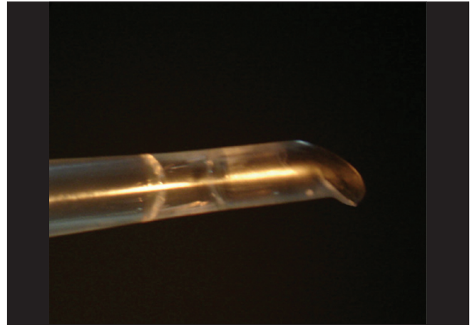
Figure 1: Downward beaking of the beveled anterior end of the Emerald C Cartridge (Lot CH00841 of Advanced Medical Optics, Inc., USA)

However, the rolled out flap was not evident any more. A corneal opacity remained at the deeper corneal layers with mild surrounding edema, even at the time of last check-up at 4 weeks post-op, with a BCVA of 20/30 [Fig. 3]. The corneal endothelial cell count 4 weeks after surgery was 2332/mm 2 .