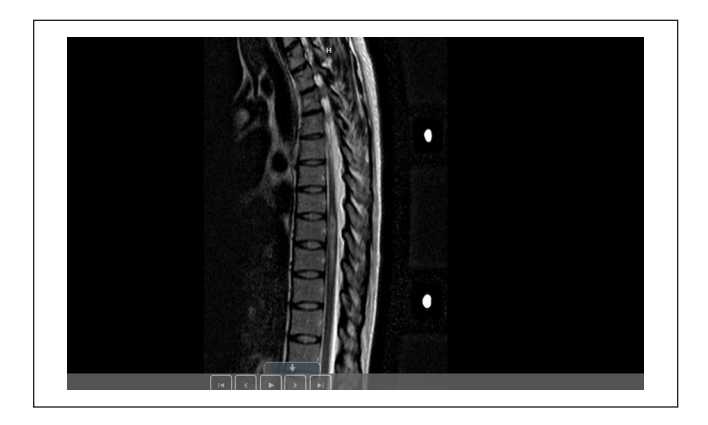
Figure 3. Sagittal T2 of the thoracic spine showed an abnormal T2 hyperintense signal from T7 through T10, measuring 5.5 cm in craniocaudal dimension. The edematous quality of this lesion is most pronounced at T8. There is a similar T2 hyperintense area within the right hemicord and dorsal cord at level T12.

Despite the abundance of MRI findings in TSC, such as focal dysplasias, hamartomas, subependymal nodules, and widespread gray and white matter signal changes, spinal cord abnormalities are rarely seen.<sup>4</sup> In our patient, extensive involvement of both cervical and thoracic cord was noted which led to the diagnosis of NMOSD, supported by the presence of AQP4-IgG antibody. Although the association of NMOSD with other autoimmune diseases has been extensively studied, its concurrence with TSC is relatively less elucidated. There are few case reports describing a coexistence of TSC and systemic lupus erythematosus (SLE). Singh and colleagues<sup>5</sup> reported a 26-year-old woman with TSC who developed aggressive SEL with acute and severe renal impairment, not responding to therapeutic interventions. Psarelis and Nikiphorou<sup>6</sup> reported a 26-year-old asymptomatic woman with TSC, who was referred to rheumatology service after detecting a high anti-ds DNA titer.