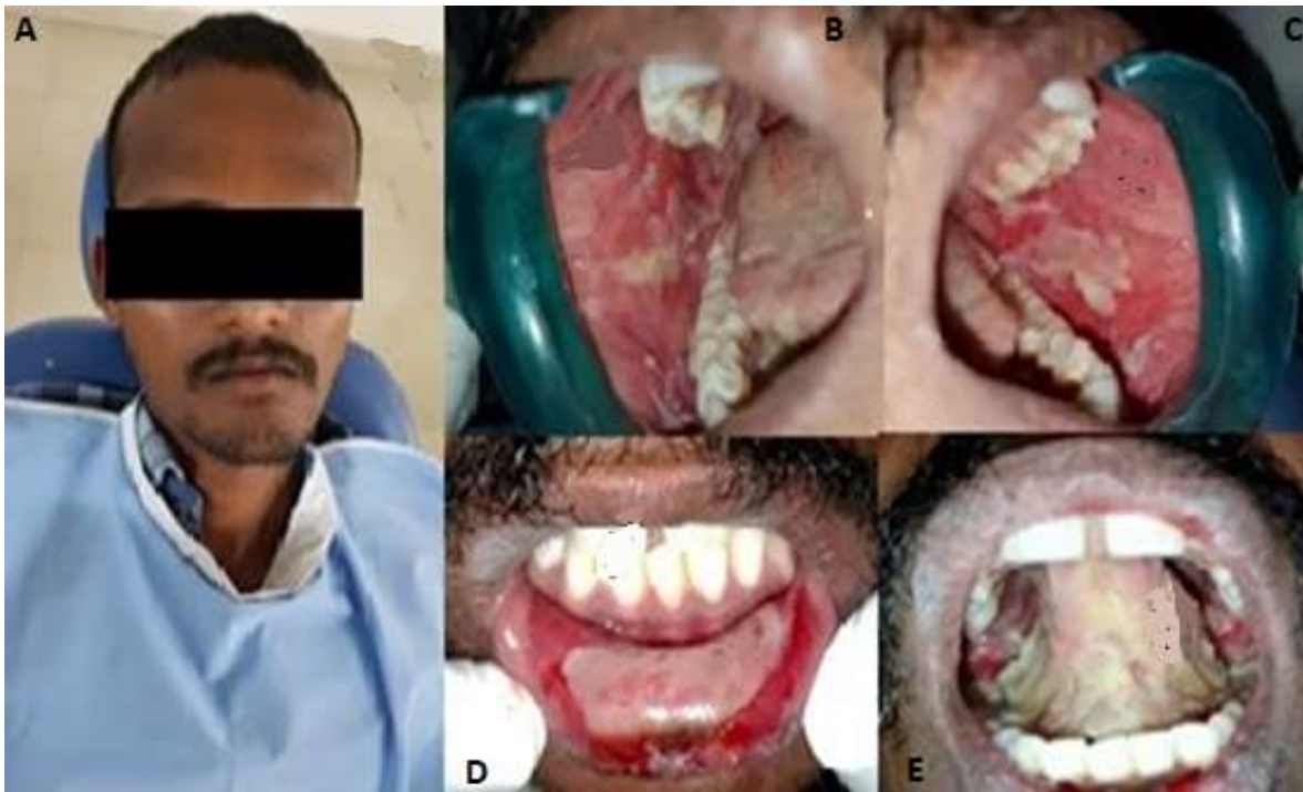
Figure 3: pre-operative pictures showing diffuse erosions and encrustations were noticed on bilateral buccal mucosa, lower labial mucosa and tongue