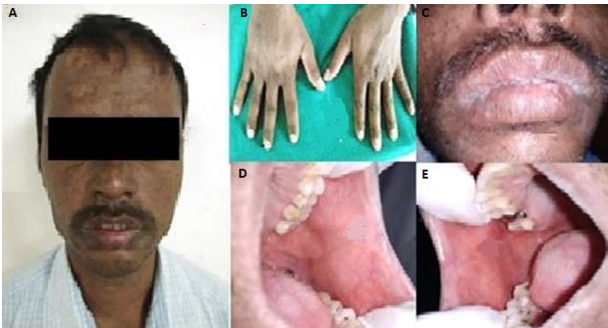
Figure 2: post-operative pictures showing complete regression of the lesions