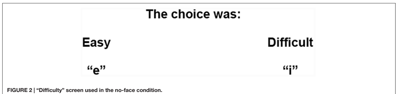
FIGURE 2 | “Difficulty” screen used in the no-face condition.