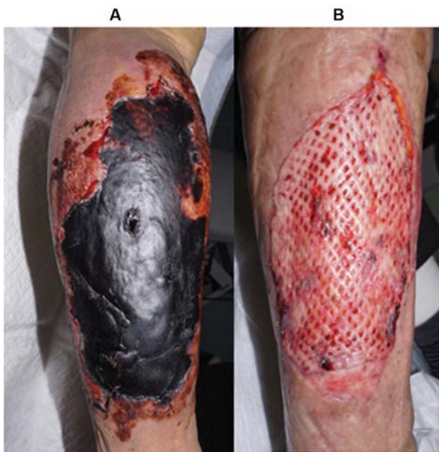
Fig. 2 (A) Necrotized and blackened skin of the right calf on Day 13 prior to debridement and artificial skin grafting; (B) successful skin grafting on Day 50.

here fits these criteria. The in vivo half-life of RIV is approximately 5 to 13 hours, and on the day of the injury, the patient had taken RIV (15 mg) and TXA (500 mg) in the morning before suffering the calf trauma. Six hours after the accident, CT scanning showed that the right calf had swollen to approximately twice its normal width due to the presence of a severe subcutaneous hematoma. RIV was withdrawn the next day but the bleeding continued and did not seem to be responding to the management with PRBC and FFP alone. In reversing DOACs, limited effectiveness of FFP was previously reported 9 while effectiveness of PCC was established. 10 In our case, initially we were hesitant to give PCC considering its thrombotic risk. Theoretically, complete metabolism of RIV