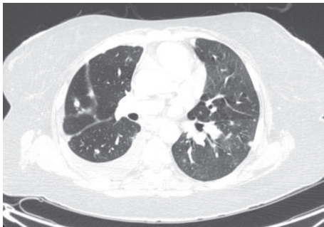
FIGURE 2: CT scan of chest showing a moderate right-sided pleural effusion, as well as bilateral pulmonary nodules with hilar adenopathy.

hyperphosphatemia (phosphate 9.8 mg/dL), hyperuricemia (uric acid 15.1 mg/dL), and hypocalcemia (ionized calcium of 1 mmol/L), without having received any chemotherapy for her malignancy. She additionally went into renal failure (creatinine of 3 mg/dL) and severe metabolic acidosis (bicarbonate of 9 mg/dL with an arterial pH of 7.259). She also had a lactate of 11.1 mg/dL. LDH was also elevated at 1263 U/L, roughly six times the upper limit of normal. Based on these abnormalities, laboratory TLS was diagnosed; given her renal failure, she also had evidence of clinical TLS.