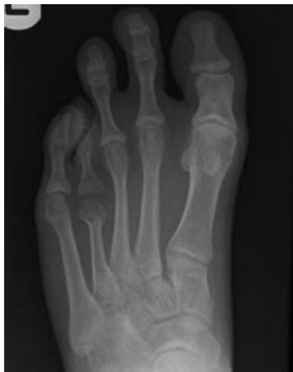
Figure 1. AP radiograph of the left foot showing 7 mm shortening of the 4 th metatarsal compared to the 5 th metatarsal head.