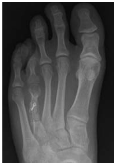
Figure 3. Post-operative AP radiograph at 6 weeks of the left foot showing the lengthening scarf osteotomy, incorporation of the bone blocks and fixation with an Omnitech ® screw of the 4 th metatarsal. The 4 th metatarsal head is 2 mm longer than the 5 th metatarsal head.