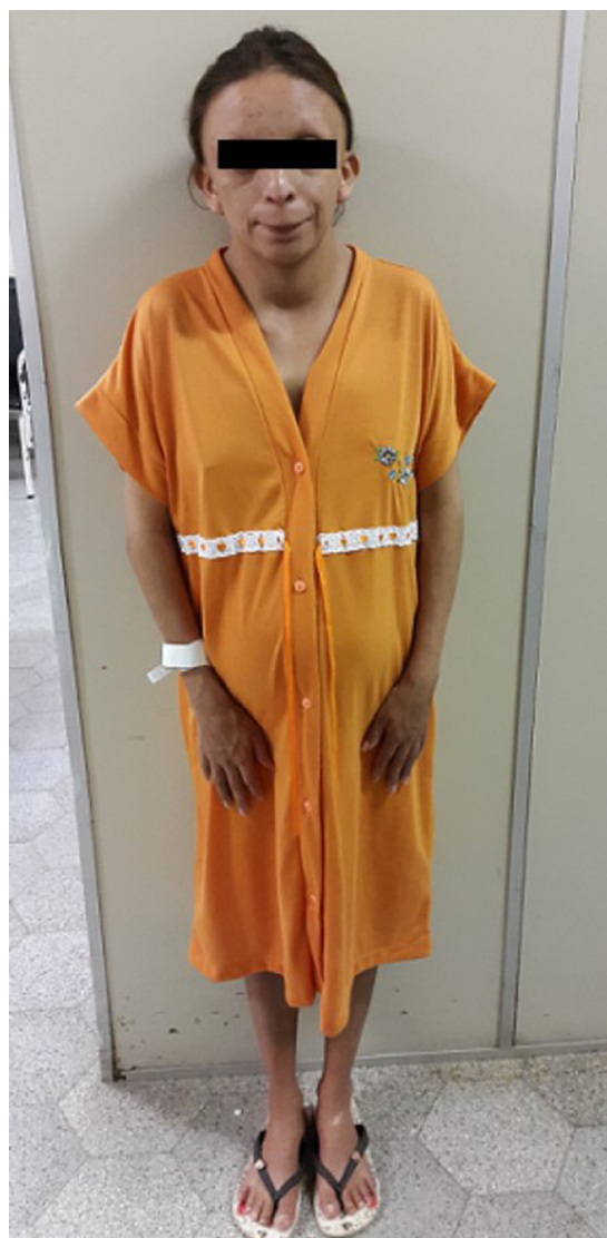
Fig. 1 39 week pregnant patient with Cockayne syndrome. Manifest short stature and cachexia.

The case was a 26 year old, 39 kg, 150 cm height nullipara patient with a diagnosis of Cockayne Syndrome (CS) admitted in labor at the gestational age of 39 weeks. An emergency C-section was indicated due to cephalopelvic disproportion (Fig. 1). Diagnosis of CS was confirmed by genetic tests, in addition to a fibroblast culture test that measures decreased RNA synthesis response after UV-radiation exposure. The physical examination showed distinctive CS features: short stature, cachexia, mildly retracted chin with birdlike facies, difficult interaction due to intellectual deficit, and hearing aid due to hearing loss (Fig. 2). Airway assessment revealed small mouth opening, protuberant teeth and Mallampati score Class IV (Fig. 3). At the operation theater, an 18 G venous cannula was instated, and continuous ECG (DII and V5), non-invasive blood pressure, and