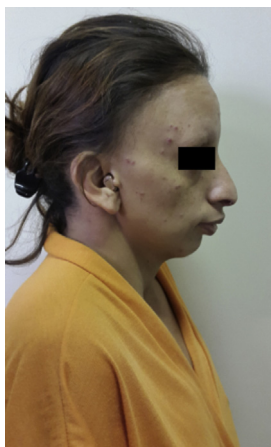
Fig. 2 Bird-like facies. Probable challenging airway management.