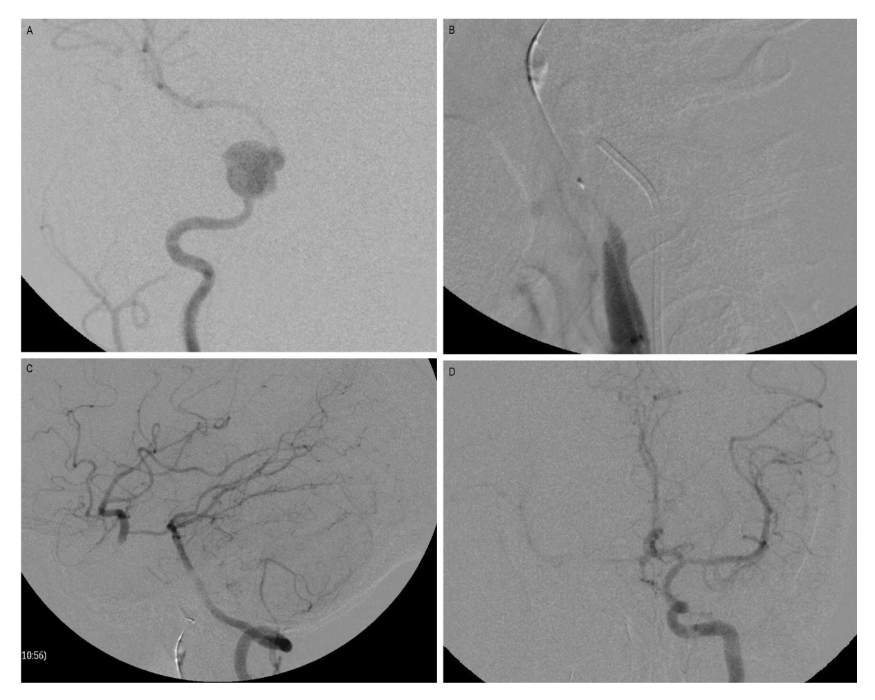
Figure1. Balloon occlusion test (BTO).

A. Angiography of the right ICA reveals a pseudoaneurysm arising from the right cavernous ICA. B. A balloon is inflated at the right petrous ICA proximal to the aneurysm. C. Angiography of the left vertebral artery reveals good cross circulation through Pcom, filling the right ICA circulation. D. Angiography of the opposite ICA reveals no adequate cross circulation through Acom.