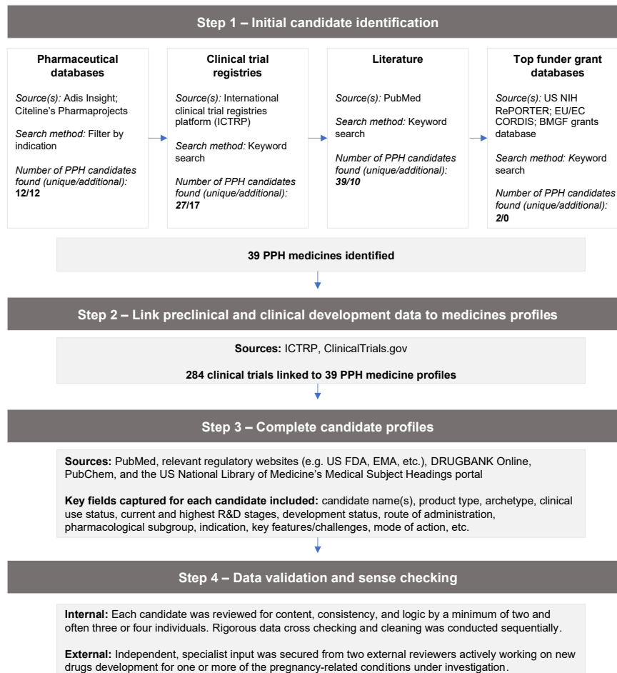
FIGURE 1 Overview of development of Accelerating Innovation for Mothers (AIM) medicines pipeline database

States National Institutes of Health (US NIH)'s RePORTER; the European Union/Commission's CORDIS; and the Bill & Melinda Gates Foundation (BMGF) grants database (supplied from BMGF). For RePORTER, we retrieved all grants dating from 2000 to present. For CORDIS, we retrieved four datasets relating to different EC program cycles: FP5 1998–2002; FP6 2002–2006; FP7 2007–2013; and Horizon 2014–2020. For BMGF, we searched datasets ranging from 2014–2019 inclusive. All datasets were retrieved and scoped for relevance between March and April 2021.