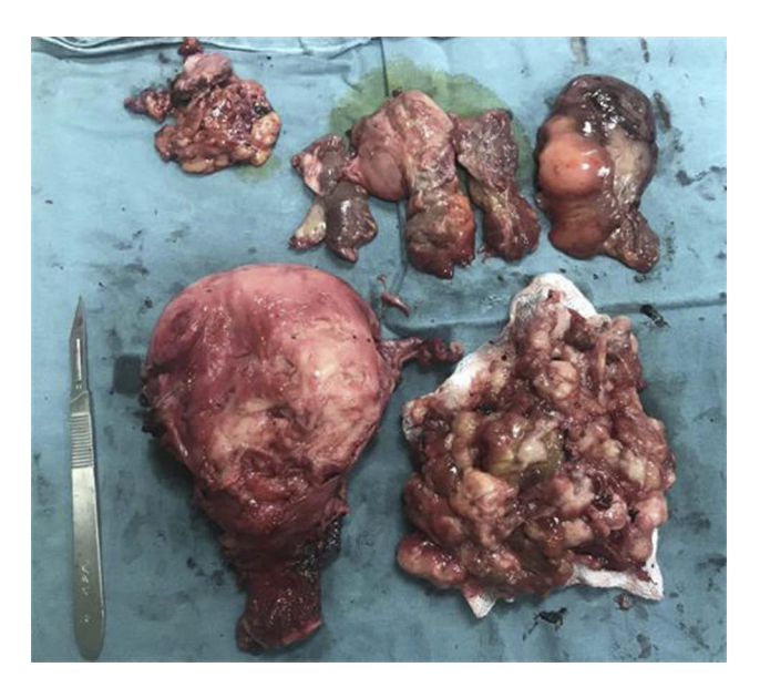
Figure 2 Uterine content was separated from the vagina by oval forceps in order to remove the whole uterus from the vagina completely.

that spindle cell tumors with rich cells and the forth showed uterine myoma with infarct. Nevertheless, postoperative pathological and immunohistochemical analyses of the surgical specimen revealed uterine leiomyosarcoma. Nucleus mitosis and coagulative necrosis were found under magnification 400 \times and one pelvic lymph node had metastasized (Figure 3).