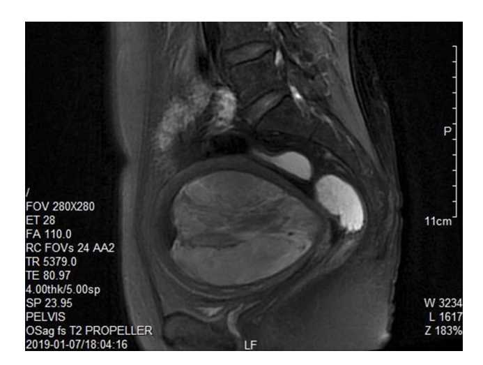
Figure I MRI showed a huge mixed-sign mass in the uterine cavity considering a uterine myoma with degeneration and bleeding.