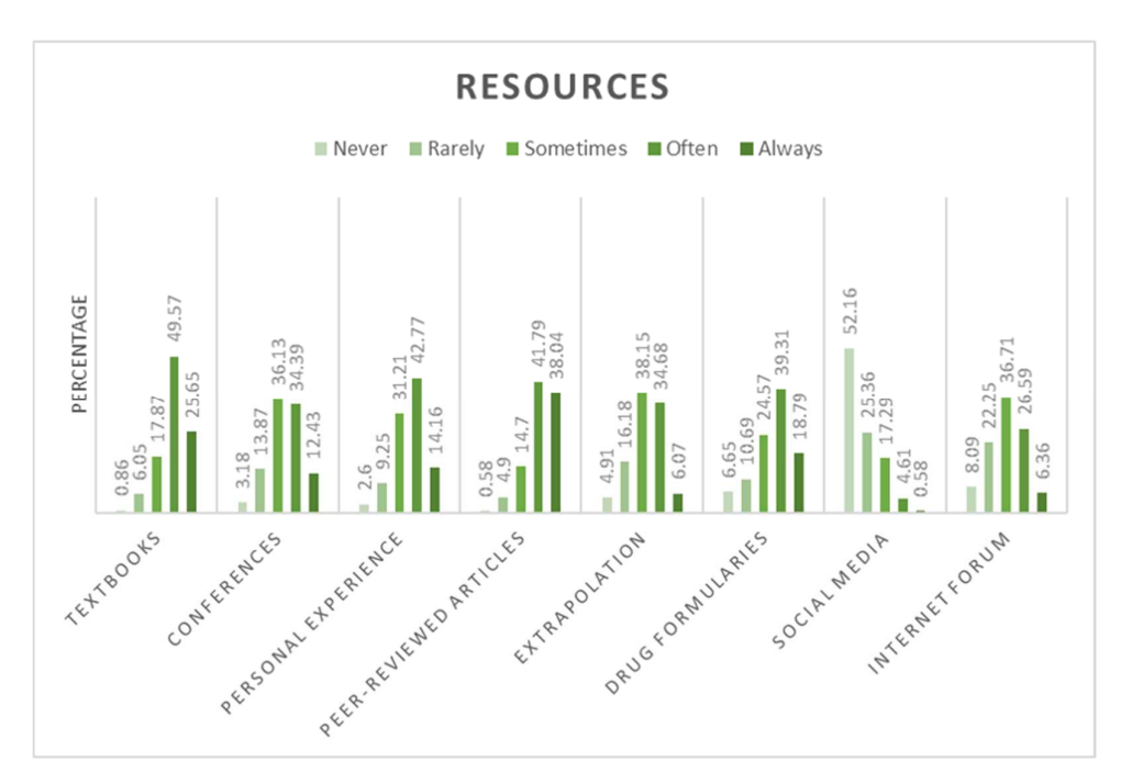
Figure 2. Resources used by the respondents (n = 417) to obtain information about analgesia and locoregional anaesthesia as it applies to non-conventional animal species. Extrapolation: extrapolation of techniques and drug doses from domestic animal species. The percentages on the y -axis indicate the proportions of veterinarians who reportedly used each specific resource on the x -axis. Never, rarely, sometimes, often and always indicate the frequency of use of the resources listed on the x -axis.

The sources that respondents consulted to obtain information on locoregional techniques in non-conventional species were original research and scientific peer-reviewed articles, textbooks, drug formularies, personal clinical experiences, conference proceedings, internet discussion and forums or webinars. However, participants also used their past clinical experience and extrapolated notions and dosages from domestic animal species (Figure 2).