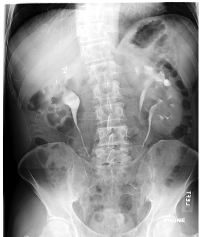
Figure 4. Intravenous pyelogram obtained 3 months postoperatively, demonstrating resolution of hydronephrosis.