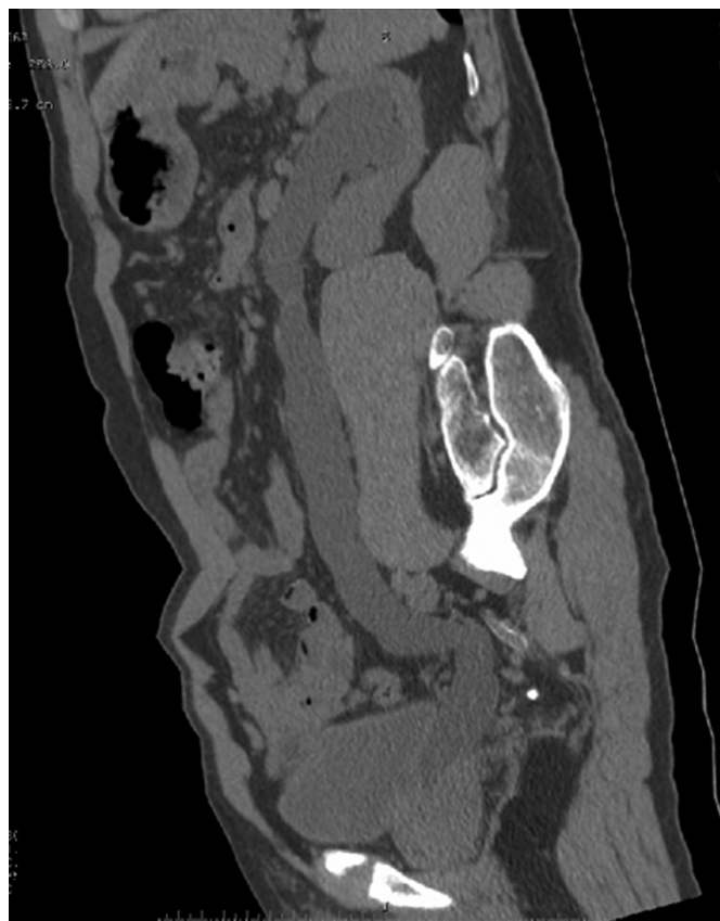
Figure 1. Sagittal reconstructed computed tomography images, demonstrating a left duplicated collecting system. Of note, there is a hydronephrotic upper pole with preserved renal parenchyma and a dilated ureter to the level of its ectopic insertion into the prostatic urethra.

The patient was placed in the low dorsal lithotomy position. Rigid cystoscopy failed to reveal the upper pole ureteral orifice in the prostatic urethra, despite careful inspection. The left lower pole ureteral orifice was visu-